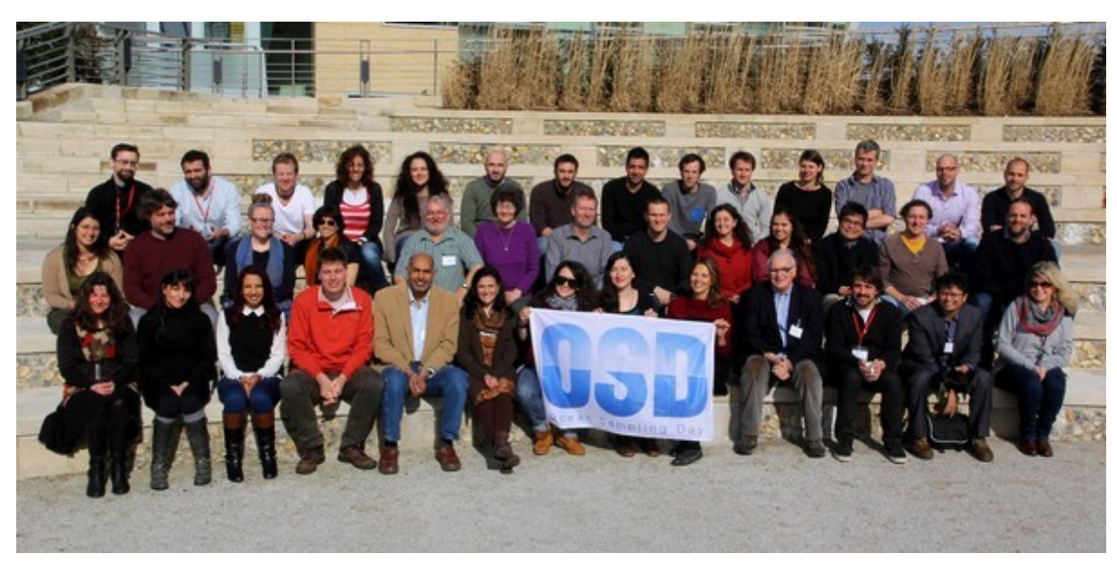
Illustration 1: Participants of the March 2015 OSD Analysis Jamboree at EMBL-EBI