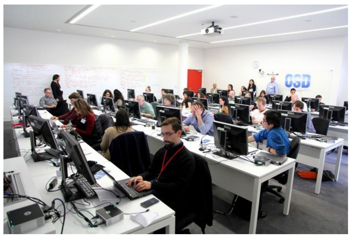
Illustration 2: Jamboree hands-on session in the EMBL-EBI computer room